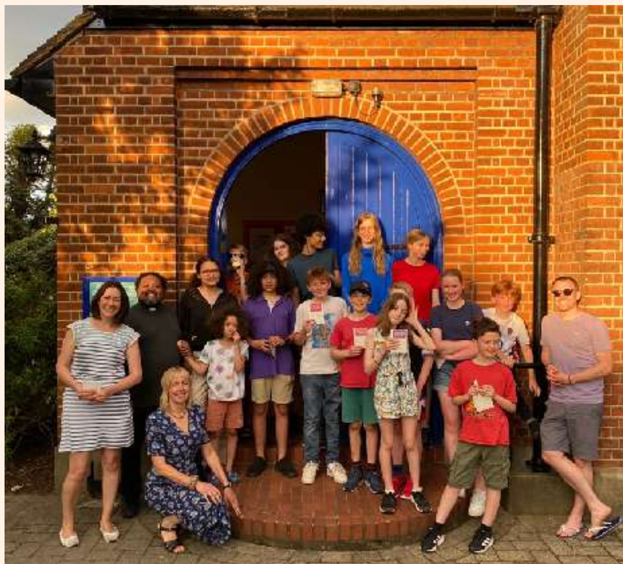
11-18Yr Youth Group - End Of School Bbq

In addition to children attending the church, we maintain strong links with our uniformed groups and local schools. In 2024, we saw over 3,000 different children in assemblies, welcomed 100 children in church for school visits and hosted school services for more than 600 young people.