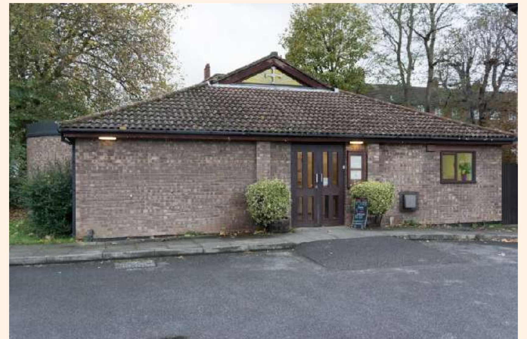
St. Peter's, Lee Church Building