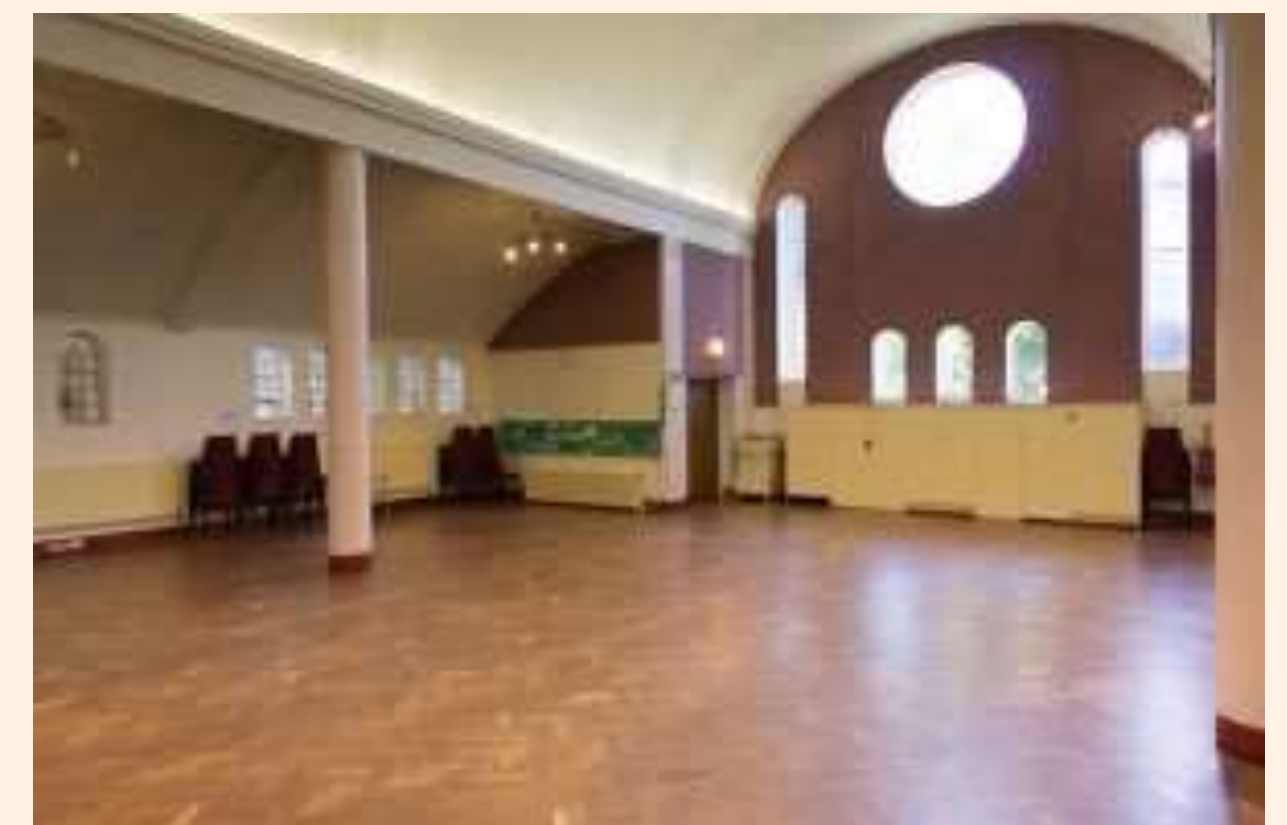
The Good Shepherd Church Main Hall