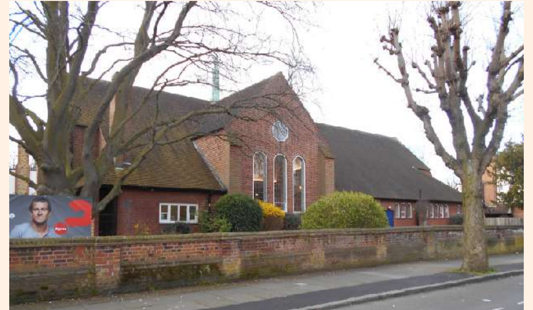
The Good Shepherd Church Building

As a church, we want to be at the heart of our local community, where all are welcome, and all have the opportunity to grow in faith.