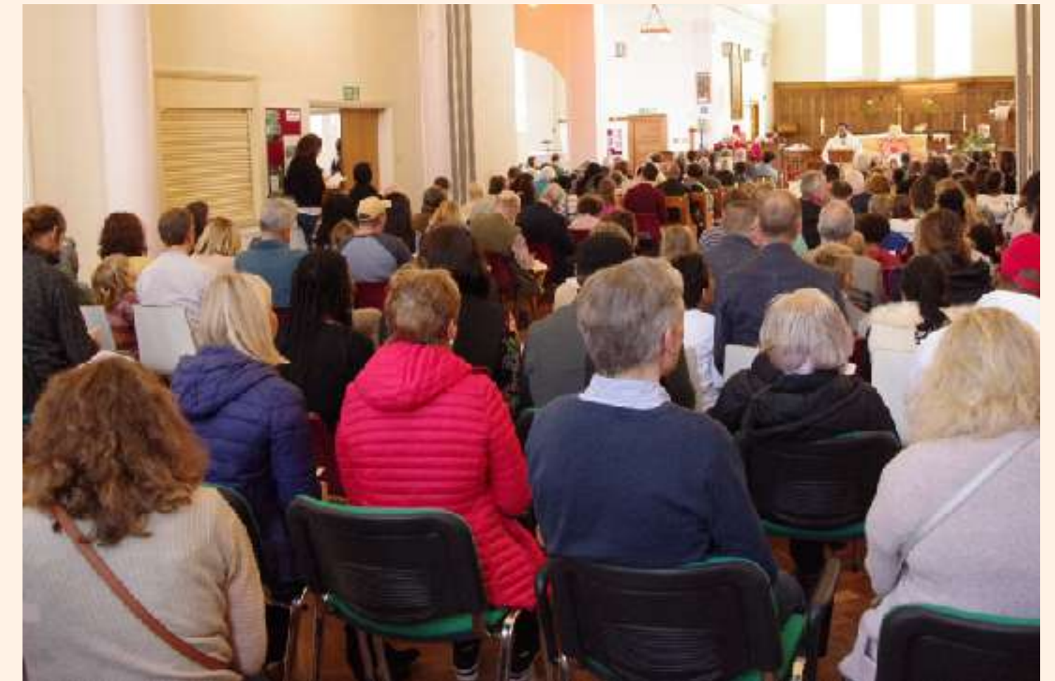
Sunday Holy Communion Service

Music plays a vital role in our worship, reflecting our desire to bridge generational and stylistic gaps. We blend time-honoured hymns with newer songs to create a space where diverse musical preferences can find their place in worship.