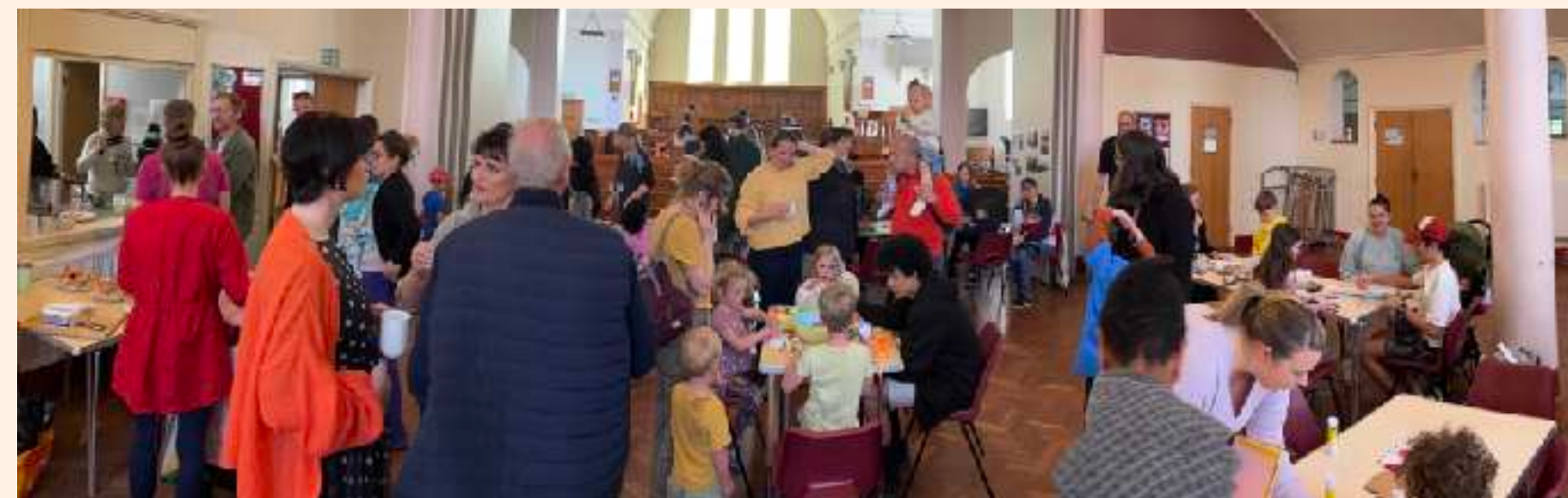
Good Friday Family Activity Morning