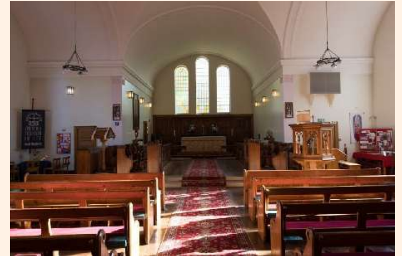
The Good Shepherd Church Building

St. Peter's is 0.7 miles (15min walk) from the Good Shepherd church building. As a flexible, multi-purpose space this building is used primarily as a community centre and as such is the location for a large amount of our partnership activity. The hall seats 35-50 people.