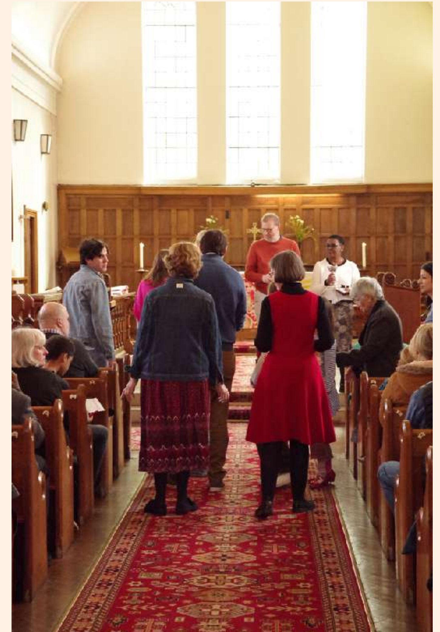
Sunday Morning Holy Communion Service

As a social congregation, many enjoy spending time together outside of Church and we organise events to fundraise and spend time socially.