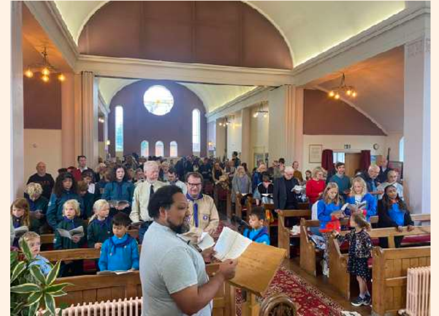
Example Of An All Age Service

Our services at Christmastime are examples of events that we consider community celebration services. We continue to be fluid and dynamic in trying and changing services based on feedback from the congregation and parish.