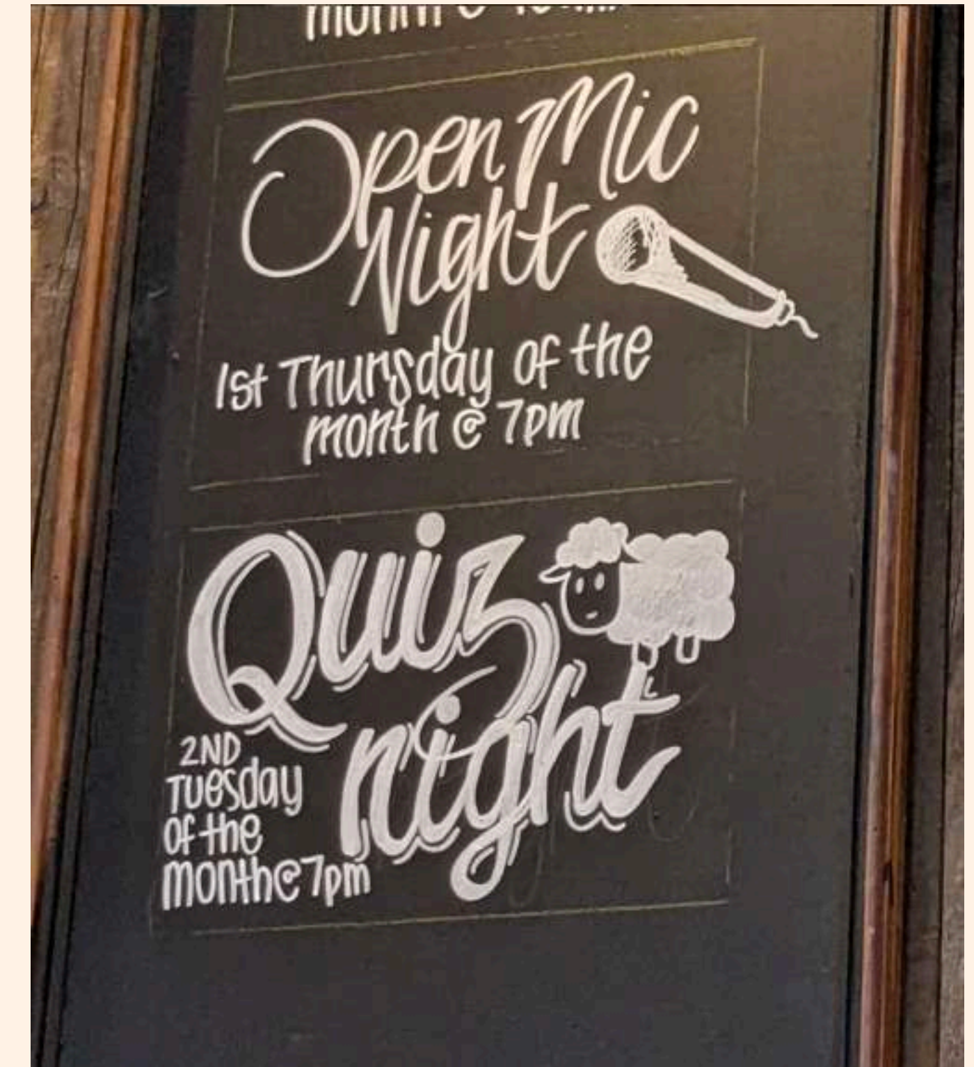
Pioneer Pilot Events At The Station Pub, Hither Green

A challenge and opportunity is to see how we can continue these two initiatives after the curacy and pilot come to their natural end.