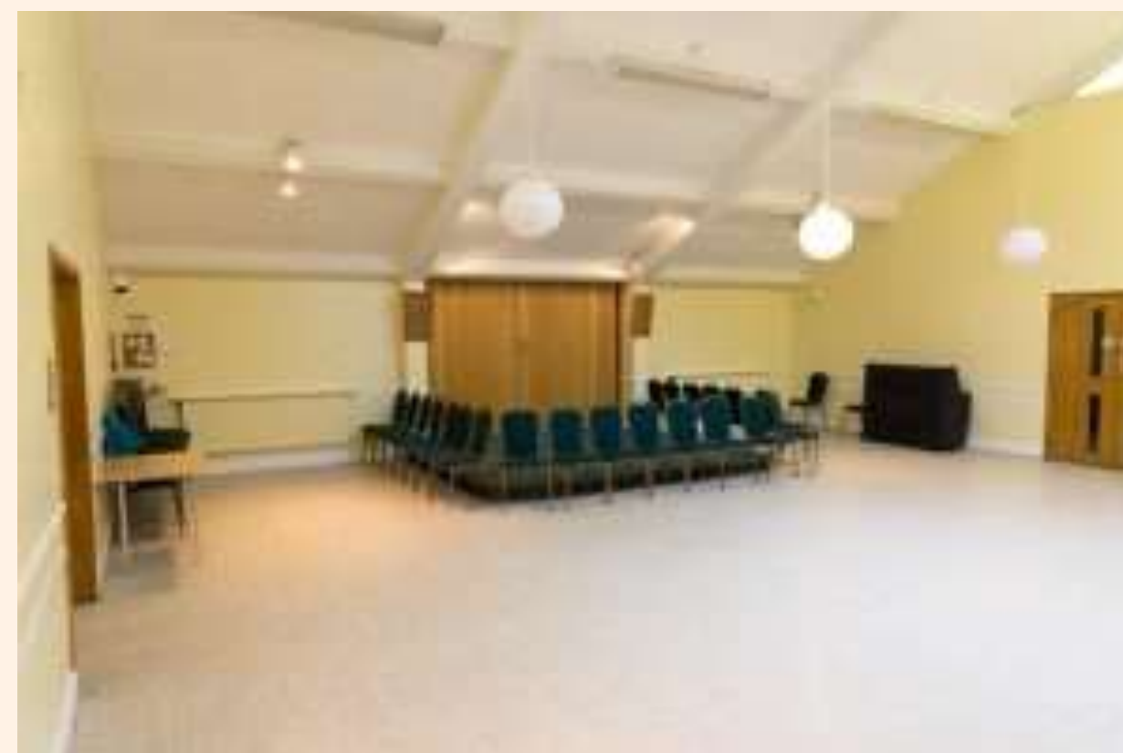
St. Peters Church Hall