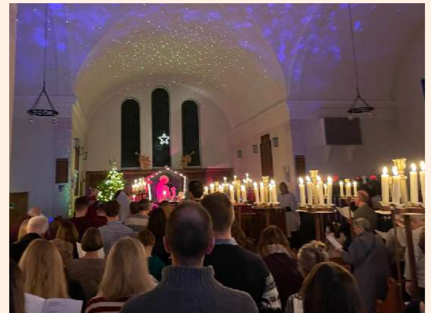
Lighting Of The Lamps Community Service