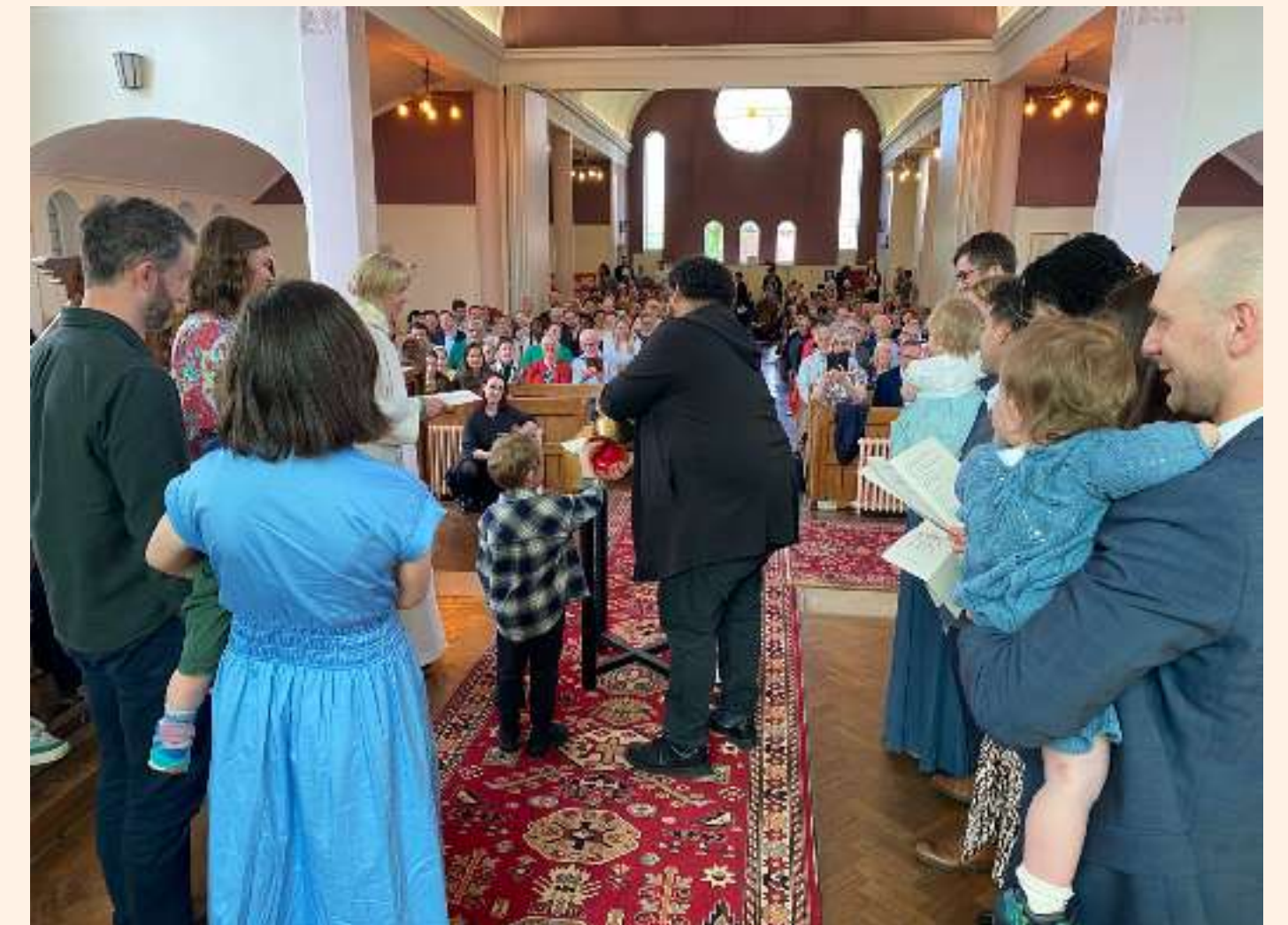
Baptism During A Sunday Holy Communion Service